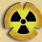
12 Radiation Tokens