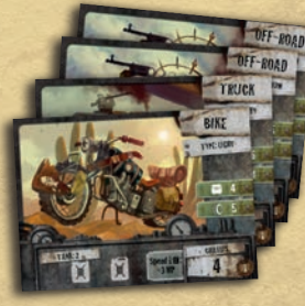
4 Vehicle Sheets