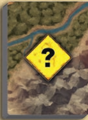
25 Wasteland Cards (Scrub / Mountains)