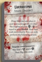
8 Injury Cards