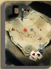
20 Exploration Cards