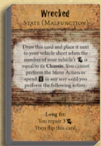
8 Malfunction Cards