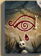
8 Special Cards