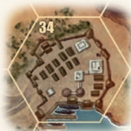
Special Location (numbered)