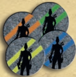
16 Knight Tokens