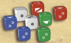
8 Custom Dice