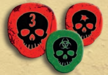
28 Wound/Biohazard Tokens