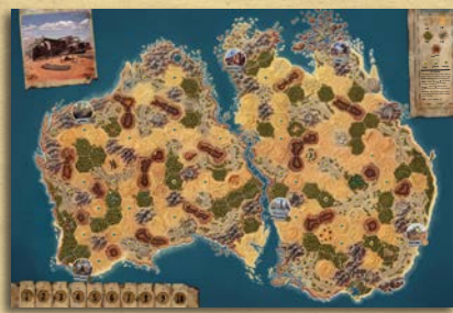
1 Game Board