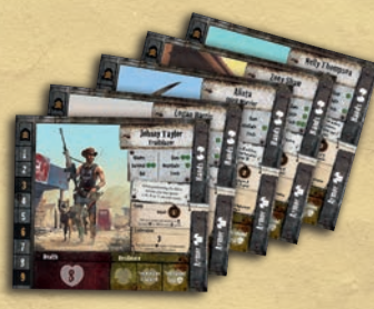
5 Knight Sheets