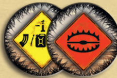
10 Threat Tokens