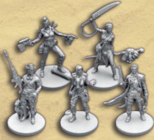
5 Knight Figures