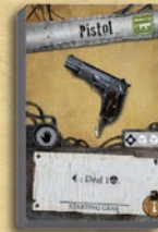
54 Gear Cards