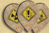
12 Challenge Tokens