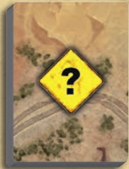
33 Wasteland Cards (Desert / Highway)