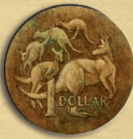
1st Player Marker