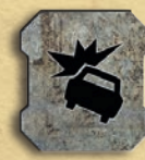
24 Damage Tokens