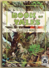
Book of Tales