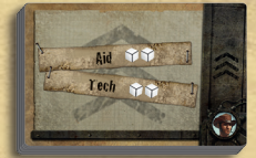
15 Upgrade Cards (3 per knight)