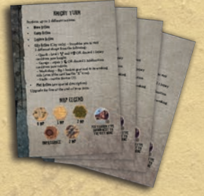
4 Reference Sheets